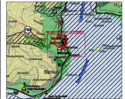
Aðalskipulag Vesturbyggðar 2018-2035